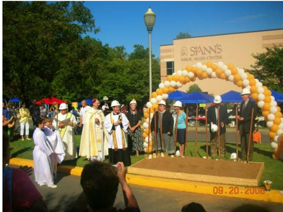
Ground Breaking for new Church at St. Ann's 2008

After 50 years, St. Ann's has built a school activity center and the grounds.. And now the Parish Sanctuary will be rebuilt in one year. The Knights have been a part and will always help. As a Kick off for the Ground Breaking - St. Ann's Knights