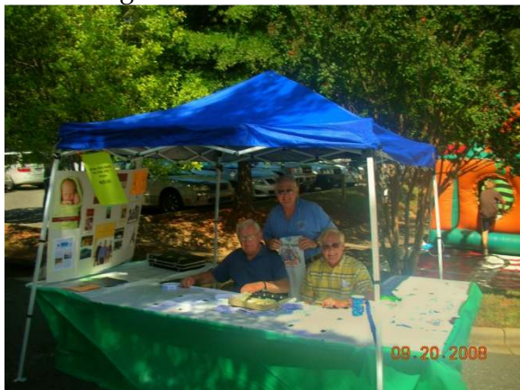
Ran a Booth and helped the Parish & provide Bingo funds

After 50 years, St. Ann's has built a school activity center and the grounds.. And now the Parish Sanctuary will be rebuilt in one year. The Knights have been a part and will always help. As a Kick off for the Ground Breaking - St. Ann's Knights