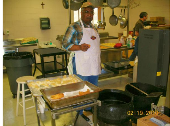
Worthy Gentlemen Brother Knights!

The Annual Fish Fry for the 6 weeks of Lent was again at St. Vincent's, with over the Knights serving about 1000 meals in total. We reached at least 4 Parishes and involved about 30 Knights each Friday. It was a lot of fun and strengthens our Brotherhood and our Parish Community.